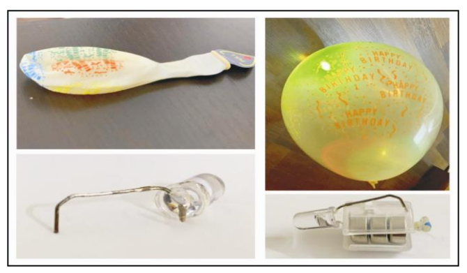
Fig. 3: LED balloon uses an encased battery attached with an LED bulb via hook.