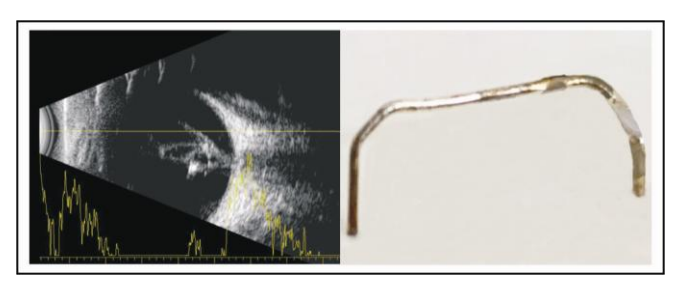
Fig. 2: (Left): B scan showing a hyper reflective IOFB with dense vitreous hemorrhage. (Right): Large metallic foreign body removed from the vitreous cavity.

At 3 months her visual acuity was 0.9 log-MAR